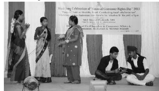
Students presenting a skit on consumer rights.