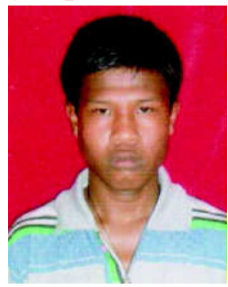
Vijay Nagar, under Educational Zone Campbell Bay, a communication from the Dy. Director Education (Plg.) said here today.