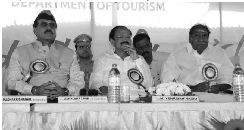
The photograph highlights a scene in the function that Shri Venkaiah Naidu, Hon'ble Minister for Urban Development, Lt Gen A K Singh (Retd.), Lt Governor of Puducherry and Shri N. Rangasamy, Hon'ble Chief Minister are keenly observing the ongoing programme of the function.