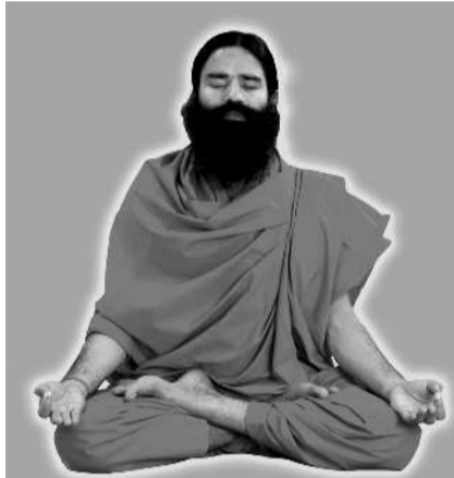
Swamiji will conduct a special yog camp for students on 5th Feb 2016 from 3 PM to 5 PM at Netaji Stadium. A similar special yog camp will also be held for ladies on 6th Feb 2016 from 3 to 5 pm at the same venue i.e Netaji Stadium.

Healing of many ailments by practicing different poses of yoga will be highlighted during the 5-day long yog shivir, which is free of cost and open to all for individuals/yogasadhaks. Donations are being collected from the individuals who willingly contribute for the setting up of 'Acharyakulam' in these Islands. The contributors will be seated in the front rows accordingly. A team of Ayurveda Doctors from Patanjali Yog Chikitsa and Dhyani Shivir Peeth Trust, Haridwar is accompanying Swami Ramdevji to attend patients, free of cost, during the camp.