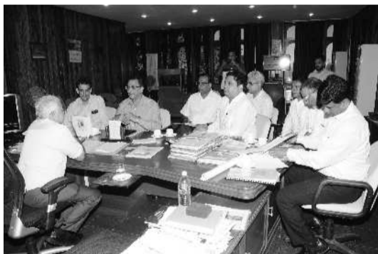
been persistently emphasizing upon the immediate need for modernization of existing fleet of helicopters and augmentation of inter-island air-transport capacity for the benefit of the islanders. All these matters and other issues relating to the Civil Aviation are being pursued vigorously.

will also initiate action for acquisition of two Seaplanes and make necessary arrangements for commencement of refuelling of Pawan Hans helicopters at Campbell Bay through Naval refuelling station, in order to augment the passenger carrying capacity to Campbell Bay. Simultaneously, the Directorate of Civil Aviation is also vigorously perusing the matter with Air India for deployment of one 70 seater ATR aircraft at Port Blair for Inter-Island services. It may be recalled that Hon'ble Lt. Governor A&N Islands Lt. Gen. A.K. Singh (Retd), has