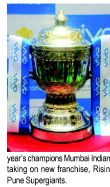
year's champions Mumbai Indians taking on new franchise, Rising Pune Supergiants.

the rights to stage the ceremony on April 8. "Ferriswheel is all set to put together a mad cricket party which will enliven the spirit of cricket. For the first time ever, India will see a 360 degree experience of seamless graphics and projection and state-of-the-art technology — all in one show," according to the release. The ceremony would also see 200 dancers and mass cast performers and a huge number of folk artists and percussionists, the release added. The opening game of IPL 9 at the Wankhede Stadium would see last