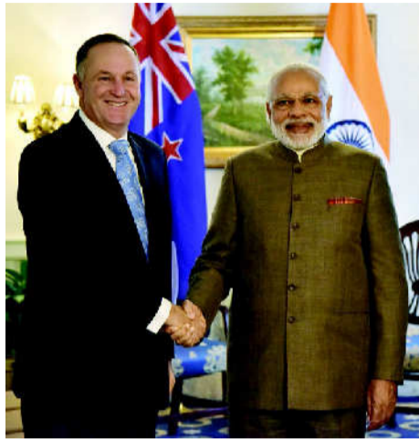
helped to make New Zealand a tourist destination.

after the bilateral talks, Ministry of External Affairs spokesperson Shri Vikas Swaroop said, both the leaders emphasized the need to have direct flights between India and New Zealand to boost tourism. Shri Swaroop said, New Zealand Prime Minister evinced keen interest to have Free Trade Agreement with India at the earliest. The spokesperson said, both leaders began their bilateral talks with Cricket and Mr Key congratulated Shri Modi for successful conduct of the T-20 World Cricket tournament and remarked that Bollywood