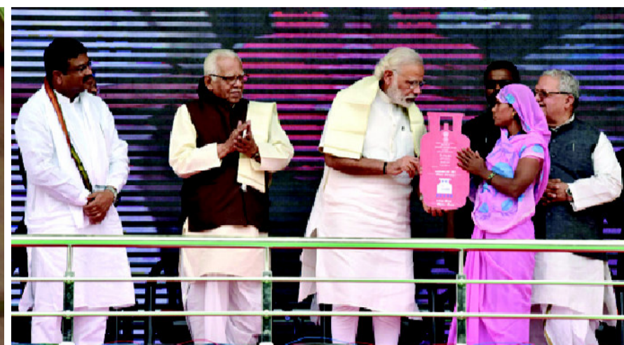
The Prime Minister, Shri Narendra Modi distributing the free LPG connections to the beneficiaries, under 'Pradhan Mantri Ujjwala Yojana', at Ballia, Uttar Pradesh on May 01, 2016.

Ballia (UP), May 1 The Prime Minister, Shri Narendra Modi, today launched the Pradhan Mantri Ujjwala Yojana at Ballia. The scheme aims to provide cooking gas connections to five crore below-poverty-line beneficiaries over the next three years.