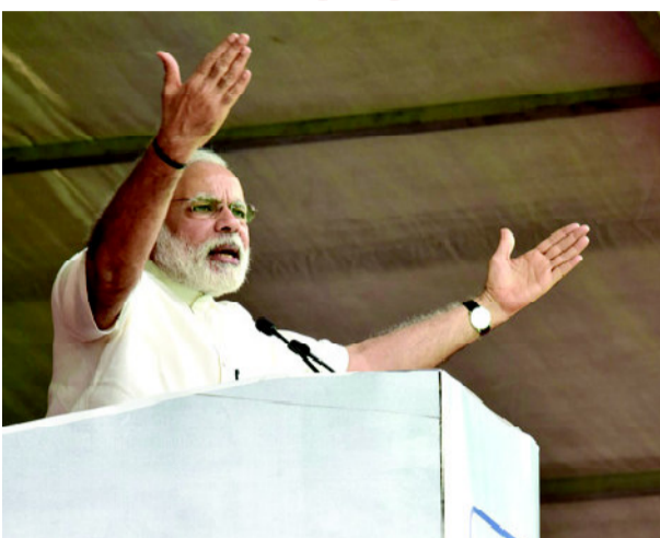
The Prime Minister, Shri Narendra Modi addressing at the launching ceremony of the 'Pradhan Mantri Ujjwala Yojana', at Ballia, Uttar Pradesh on May 01, 2016.