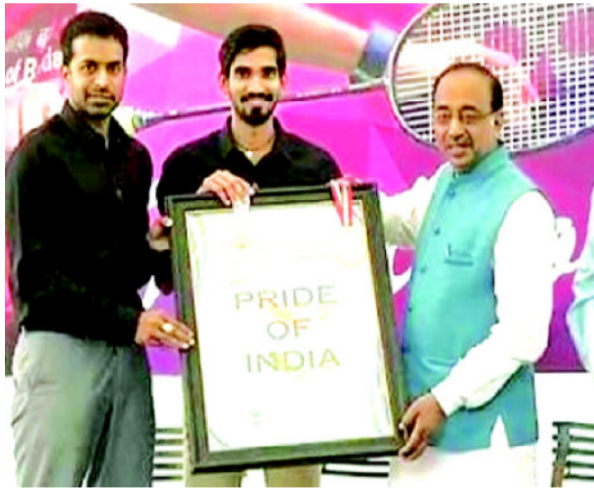
Shri Goel said the country is proud of achievement by Mr Srikanth.

On the occasion, Sports Minister Shri Vijay Goel assured the sport persons that government will provide all possible assistance to them.