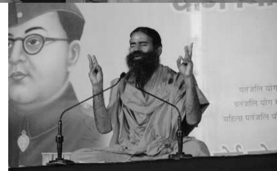
Islands, he said.

Param Pujiya Yog Rishi Swami Ramdevji's yog camp at the Netaji Stadium here early this morning evoked overwhelming response as a huge number of yog enthusiasts thronged his yog camp, at 5 am. Hundreds of women, men and children of different age groups watched in rapt attention as Ramdevji with the buzzword 'Karo Yog; Raho Nirog', demonstrated various techniques of yog. They, along with Swamiji practiced basics of yog such as dhayna, pranayama, vyayam and asanas.