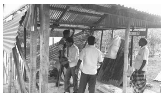
the Revenue officials. Meanwhile, based on the

Taking a serious view on the encroachment issue, the District Administration has intensified the eviction drive. Consequently, about 20 hutments were removed from School Line Village today by