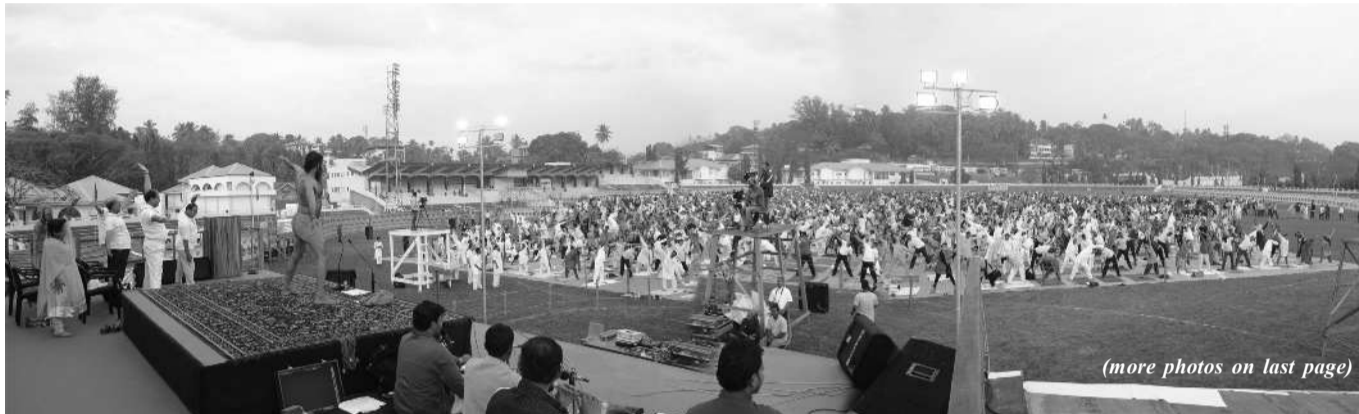
(more photos on last page)