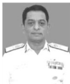
Campbell Bay and Shibpur. The Admiral was