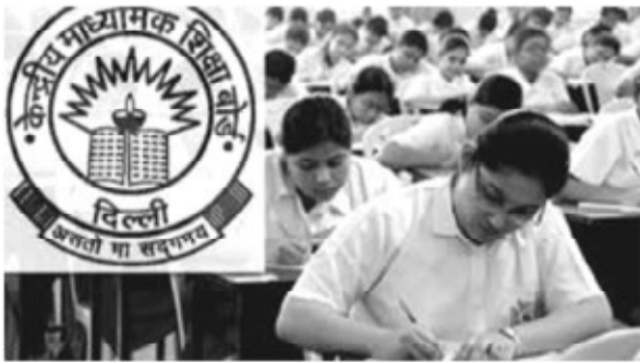
Mathematics paper and keeping in mind the paramount interest of students, the decision has been taken not to conduct re-exam for class 10.