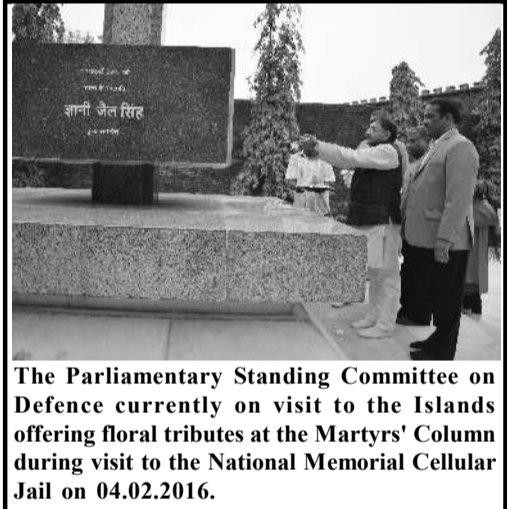
The Parliamentary Standing Committee on Defence currently on visit to the Islands offering floral tributes at the Martyrs' Column during visit to the National Memorial Cellular Jail on 04.02.2016.