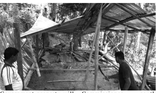
Government property will also be registered. Local law abiding people have also appreciated the encroachment eviction drive and coming forward in giving information about the encroachments. In a press release received here today, the Deputy

Port Blair, Feb 04 The Revenue Department in an ongoing encroachment eviction drive removed 20 encroachments in Corbyn's Cove and Aberdeen village today. In the drive, machineries like excavator were also used and permanent encroachments removed. Hitherto there was practice by encroachers to re-encroach the land once drive is over, to curb such practice and with a view to take stern action, FIRs are also being lodged against such unscrupulous elements. Information is also being collected about the encroachers and criminal cases of trespassing into the