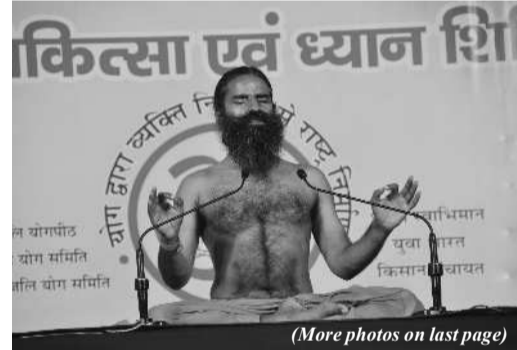
'pranayama' and 5 small physical exercises (sukshma asanas) to keep themselves healthy and free from stress. Swamiji was all praise for the participants who turned out at yog venue sharp at 5 am. "I