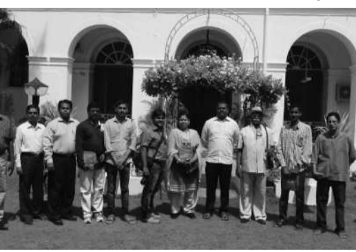
The media delegation from A& N Islands, alongwith the Secretary to the Lt. Governor at Puducherry Raj Niwas on 04.02.2016.