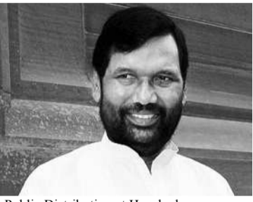
Public Distribution at Havelock. The Union Minister will also be visiting the National Memorial Cellular Jail and Ross Island. On completion of visit, Shri Paswan will leave for the mainland on Feb 7, 2016, an official communication said here today.

Port Blair, Feb 4 Shri Ram Vilas Paswan, Hon'ble Union Minister of Consumer Affairs, Food & Public Distribution is scheduled to arrive here on a two-day visit to the Islands tomorrow (Feb 5, 2016). The itinerary of the Union Minister during his stay here includes holding Inter-session meeting of the Consultative Committee of Consumers Affairs, Food and Public Distribution at 11.30 am in the conference hall of Megapode Resort tomorrow (Feb 5). Thereafter, the Minister will formally launch the National Food Security Act in A&N Islands at 1 pm at the same venue. The Union Minister will also be addressing a press conference at Megapode Resort at 1.05 pm tomorrow itself. The programme of the Minister for Feb 6 includes holding meeting of the Consultative Committee of Consumers Affairs, Food and