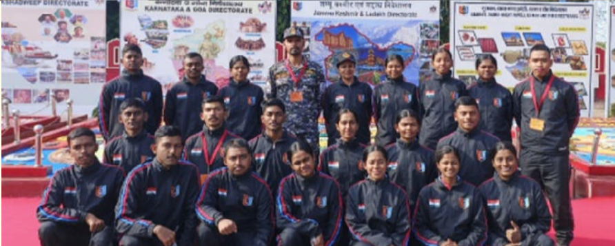
tribute to the nation's bravest soldiers.