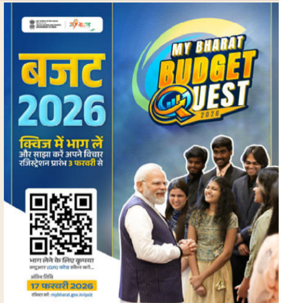
युवाओं की विकसित भारत बजट पर बात PM मोदी के साथ

Based on performance in the quiz, top scorers will be shortlisted for the State/UT-level Essay Round, wherein participants will submit an