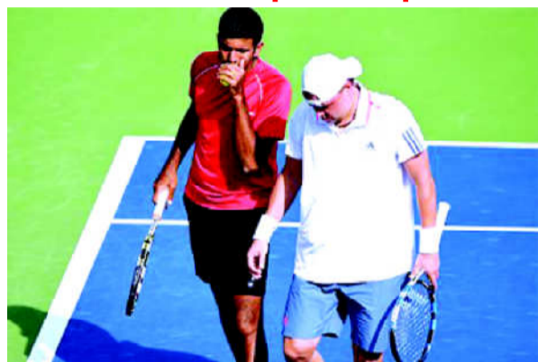
performance of the season for Bopanna, who is playing with his fourth different partner of the season. There is no Indian competing in the singles of the championships.

Dubai, Mar 4 India's Rohan Bopanna and his Polish partner Marcin Matkowski will play the men's doubles final of the Dubai Duty Free Tennis Championships today. The unseeded pair clash with fourth seeded Rojer Jean-Julien of Netherlands and Tecau Horia of Romania. Bopanna Matkowski duo knocked out the Indo spanish pair of Leander Paes and Guillermo Garcia-Lopez 6-3, 3-6, 10-6 in the semi-final of the hard court tournament yesterday. This was the second best