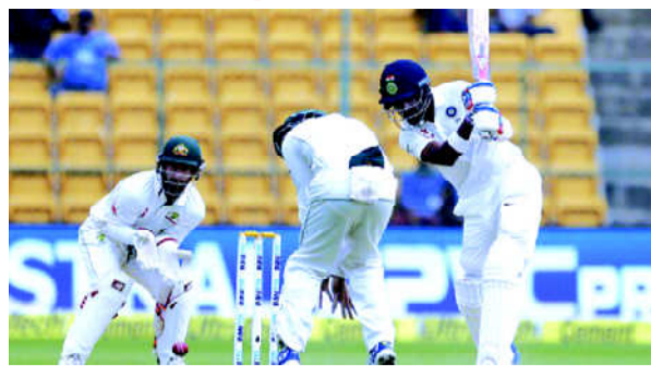
Kohli won the toss and elected to bat. The hosts are currently trailing 1-0 in the four match test series against Australia.

Bengaluru, Mar 4 Australia was 40 for no loss in their first innings on the opening day of the second Cricket Test against India in Bengaluru when stumps were drawn this evening. Earlier in the day, India was bundled out for 189 in their first innings. K L Rahul was the highest scorer with 90 runs. Nathan Lyon took 8 wickets for 50 runs for the visitors. Indian skipper Virat