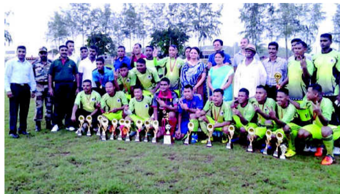
DT Correspondent Port Blair, June 04