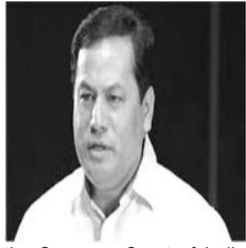
the Supreme Court of India has ruled that BCCI is a public

New Delhi, Aug 4 Sports Minister Shri Sarbananda Sonowal has said that the Indian Cricket Board, BCCI need to be made accountable and transparent in its functioning. Responding to a question whether BCCI should be brought under the purview of Right To Information Act, the Sports Minister said