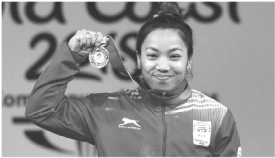
Gold Coast, Apr 5 World champion weightlifter Mirabai Chanu (48kg) went on a record-smashing spree, claiming three of them in a power-packed performance, to secure India's first gold medal at the 21st Commonwealth Games here on Thursday. In a remarkable performance, Chanu smashed the Commonwealth and the