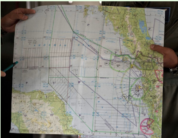
The image shows a map of Strait of Malacca.

New Delhi: Great Nicobar Island, the southernmost point of India, which is closer to the coasts of Thailand, Malaysia and Indonesia than to mainland India, is set to witness one of New Delhi's biggest and most strategic developments in decades. Spread across 166 square kilometres, the project includes construction of a transshipment port, a civilian-military airport, a power plant, tourism infrastructure and a township for 350,000 people on the island. It is slated for completion over three decades, with its first phase due by 2028.