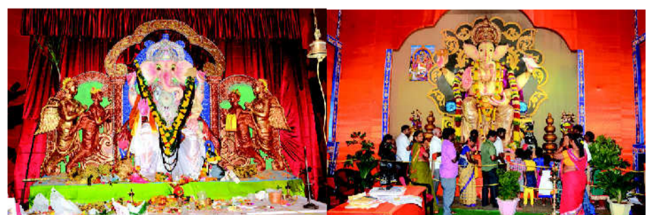
Ganesh puja celebration in Isles begins amidst chanting of hymns. People were seen offering prayers at the puja pandals set up in different places in the city.