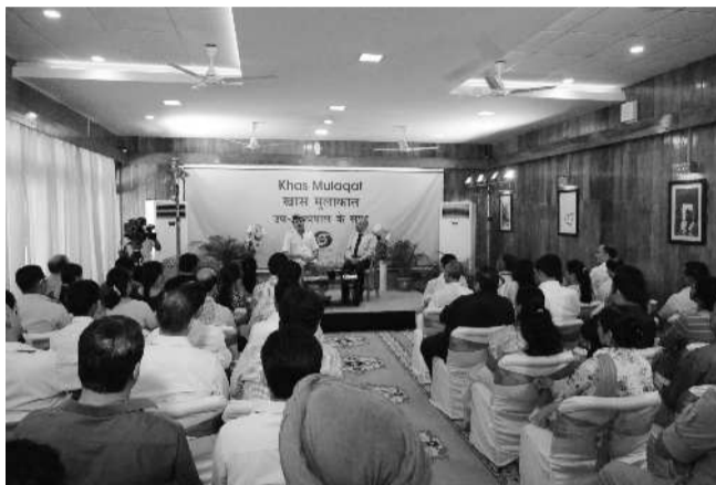
Port Blair, Jan 6