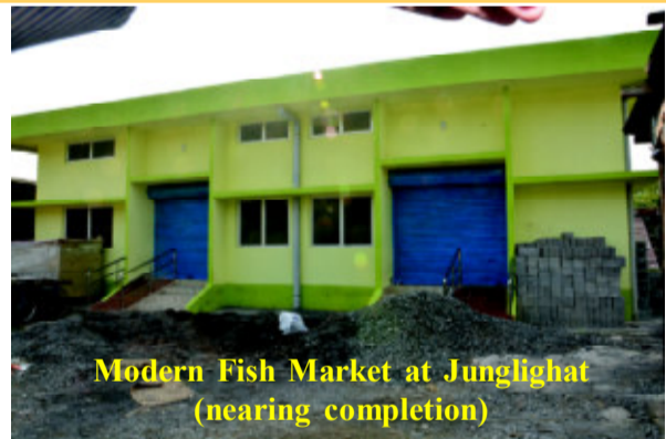
Modern Fish Market at Junglighat (nearing completion)

With a view to ensure safe and hygienic marketing of fish catch, the Fisheries Department is constructing two Modern Fish Markets, one each at Junglighat & Mohanpura. While the construction of Model Fish Market at Junglighat is nearing completion and is expected to become operational soon, the construction of Modern Fish Market at Mohanpura has also commenced and is