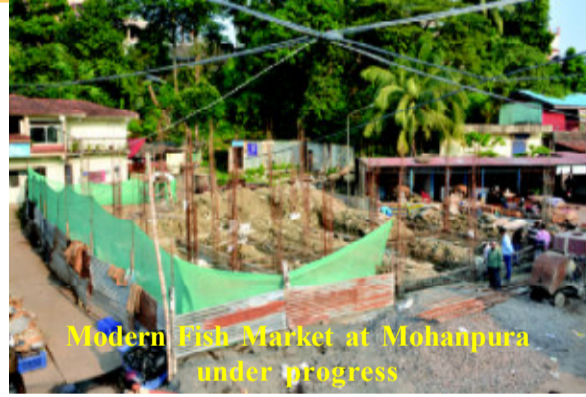
Modern Fish Market at Mohanpura under progress

expected to be completed by November-December-2018.