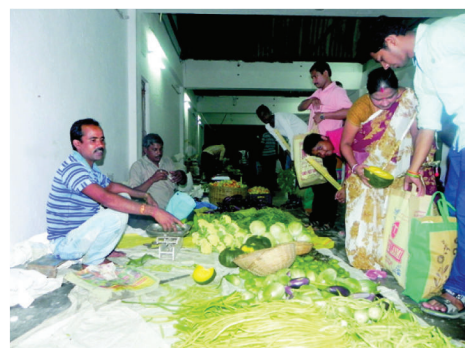
Pic show: Varieties of fresh agri produce & handicrafts sold at 'SHG Haat' at ITF Ground on 06.3.2016. The National Bank for Agriculture & Rural Development, Port Blair (NABARD) in association with the A&N Administration organized the three-day 'HAAT' (market) at the ITF Ground from March 4 to 6, 2016.

Govt committed... (Contd. from page 1) top most priority for India. He said Government is exploring new ways to empower women by providing equal opportunity in political, economic and public life. In his address, Environment and Forest Minister Shri Prakash Javadekar said Narendra Modi government is committed to ensure growth as well as work towards environment conservation. He said coal conservation is a hazard but a mainstay in developing countries. Shri Javadekar said India's coal consumption is 50 percent that of which US consumes despite having tremendous shale gas.