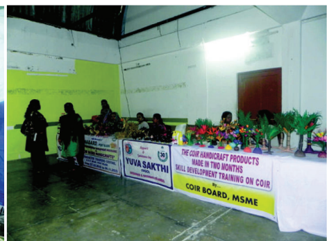
Pic show: Varieties of fresh agri produce & handicrafts sold at 'SHG Haat' at ITF Ground on 06.3.2016. The National Bank for Agriculture & Rural Development, Port Blair (NABARD) in association with the A&N Administration organized the three-day 'HAAT' (market) at the ITF Ground from March 4 to 6, 2016.