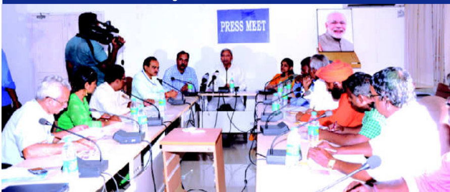
Port Blair, May 6

The new Rights of Persons with Disability Act 2016, which is effective from 19th April 2017, can be easily implemented in these small Islands, where population