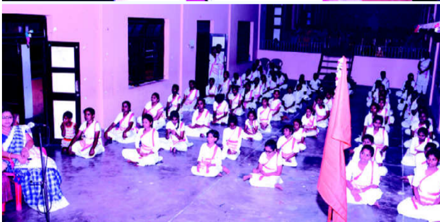
Port Blair, May 6