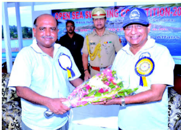
Port Blair, May 6