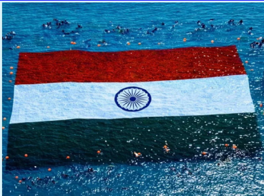
The giant national flag is unfurled by a team of some 200 scuba divers

Two underwater Guinness World Records (GWR) have been set by scuba divers in the Andaman & Nicobar Islands as part of a drive to promote the Indian union territory as a diving-tourism destination. The "Tallest Human Stack Underwater" record was achieved on 3 May, the day after the "Largest National Flag Unfurled Underwater", with both records ratified on the spot by a GWR adjudicator. The stack consisted of 14 scuba divers standing on each others' shoulders to form a 22.3m-high tower that held steady for three minutes. The feat was carried out at the Lighthouse dive-site on Swaraj Dweep in the eastern Bay of Bengal, surpassing a target height of 10m. The flag display in the shallows at Radhanagar Beach was carried out by more than 200 scuba divers who succeeded in unfurling and displaying India's