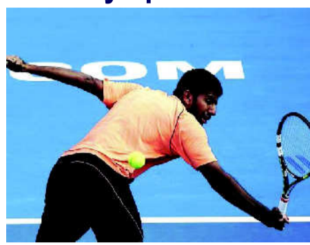
continued to be joint world No. 1 with Swiss partner Martina Hingis.