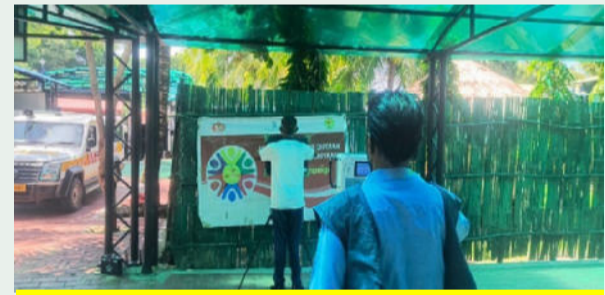
Ayushman Arogya Shivir conducted at ICG Station, Kamorta

Sri Vijaya Puram, July 6 The Andaman & Nicobar Administration has been actively implementing the TB Mukht Bharat Abhiyaan - 100 Days Intensified Campaign since its launch on 24 th March 2026, in alignment with national guidelines. The campaign focuses on a comprehensive and targeted approach to eliminate Tuberculosis (TB) with early identification of all missing TB cases through proactive screening using chest X-rays and upfront NAAT testing among vulnerable populations and high-risk settings. The campaign adopts