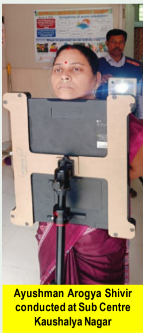
Ayushman Arogya Shivir conducted at Sub Centre Kaushalya Nagar

The Administration reiterates its commitment to achieving a TB-free Andaman & Nicobar Islands through sustained efforts, community participation, and strengthened healthcare delivery systems, a press release from State Health Society said.