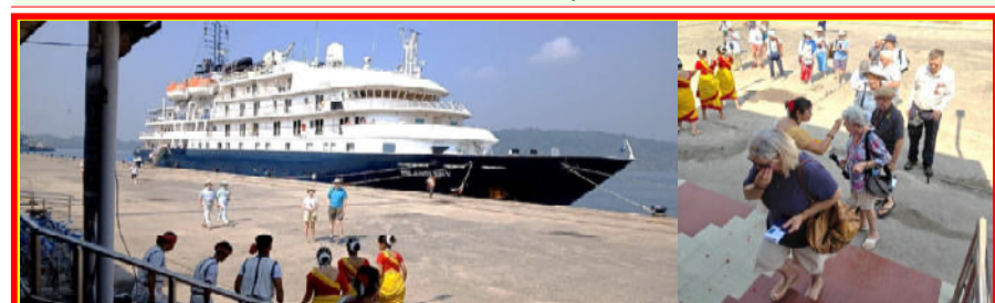
Pic shows: A Tourist Cruise Vessel- "Island Sky" with 93 tourists on board arrived from Sri Lanka and made a port call at Haddo Wharf, Sri Vijaya Puram today, drawing considerable attention along the waterfront. On disembarkation, the tourists were accorded a warm welcome by officials of Tourism Department and local agents. The visit of the vessel is expected to further boost tourism activities and enhance international cruise connectivity to the Andaman & Nicobar Islands.

solemn function for paying tributes to the heroes of First War of Independence, a press release from Director (Art & Culture) said.