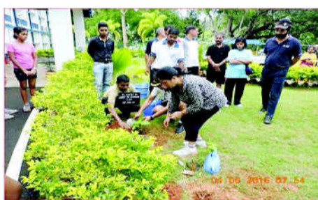
starting from NSRY and taking a route through the Foreshore Road. The families including the children of Yard employees participated in the event