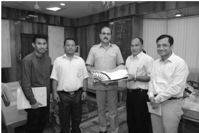
The Chief Captain, Chowra Island, Shri Paul David, along with a group of tribal people of Chowra called on the Hon'ble Lt Governor, Lt Gen A K Singh (Retd) at Raj Niwas on October 7, 2015. Various issues and problems of the Chowra people were discussed on the occasion. The Lt Governor assured them that their problems will be looked into. He also presented them the Indian National Flag so that they can hoist the flag in Chowra Island.