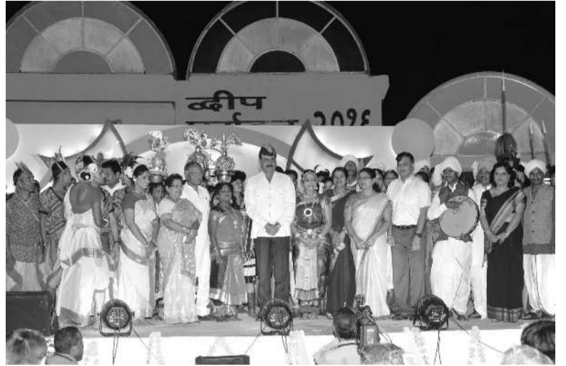
Variety of cultural.. (Contd. from page 1)