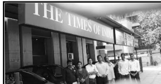
The local media team in front of the Times of India Office at Chamiers Road, Nandanam, Chennai on 08.02.16.