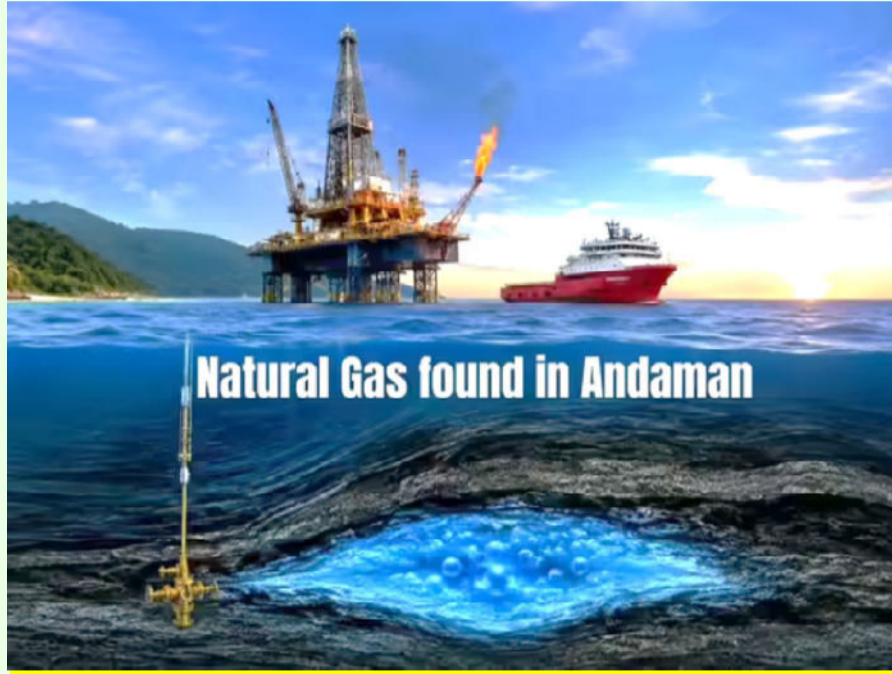
Andaman gas discovery news

The significance of the discovery goes beyond a single well. For years, geologists and policymakers have believed that the Andaman Basin could hold large hydrocarbon reserves. The latest finding strengthens that belief