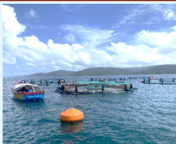
Cage culture at Chidiyatapu

landmark achievement not only for the Islands but also for the entire country. This pioneering initiative reflects the Administration's proactive efforts in promoting responsible and scientifically managed mariculture, facilitating private sector participation, and ensuring compliance with the newly introduced statutory framework governing coastal aquaculture. The achievement reinforces the Andaman and Nicobar Islands' position as a frontrunner in sustainable marine aquaculture development and opens new avenues for investment, employment and the blue economy.