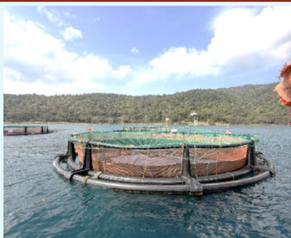
Cage culture at North Bay

The Andaman and Nicobar Islands has achieved a historic milestone in the field of sustainable mariculture with the first-ever registration in India of a commercial Open Sea Cage Culture Farm under the provisions of the Coastal Aquaculture Rules, 2024. The Open Sea Cage Culture Farm established by Islands Aquaculture & Marine Services (SHG) in the sea area leased by the Department of Fisheries, A&N Administration has been granted registration by the Coastal Aquaculture Authority (CAA), Chennai marking a