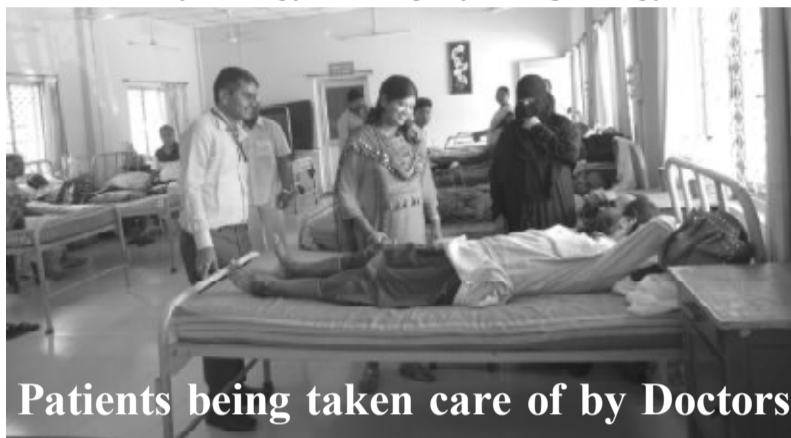
Patients being taken care of by Doctors