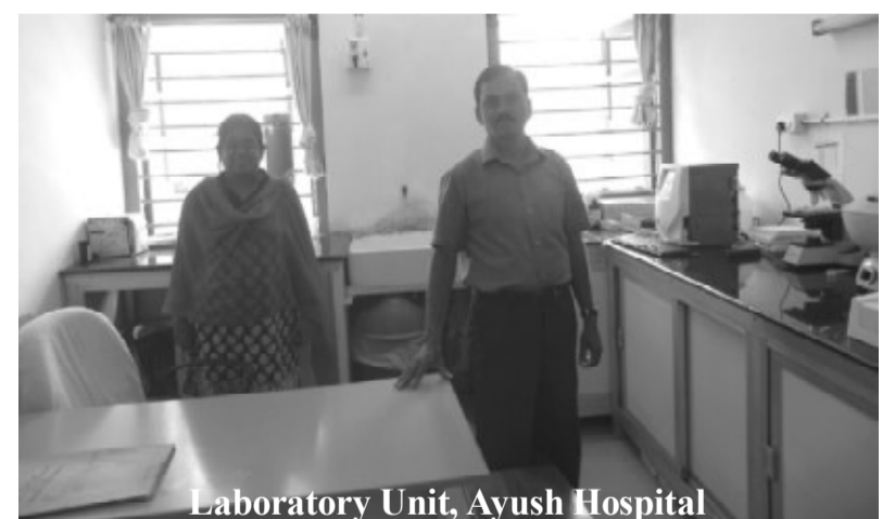
Laboratory Unit, Ayush Hospital