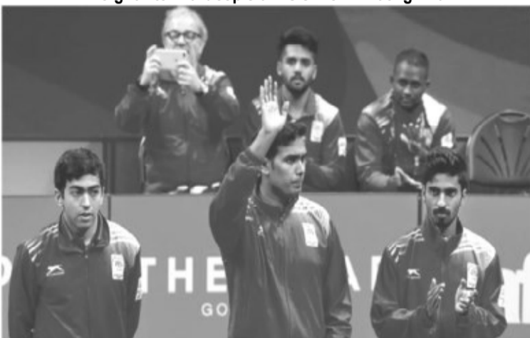
India men's TT team beat Nigeria for gold

In lawn bowls, the women's pairs team beat Wales 20-16, the men's fours team lost to South Africa 7-21 and the women's triples team to Fiji 15-23. India beat Papua New Guinea 24-6 in women's triples while Krishna Xalxo lost 19-21 to Robert Paxton of England in the men's singles event.