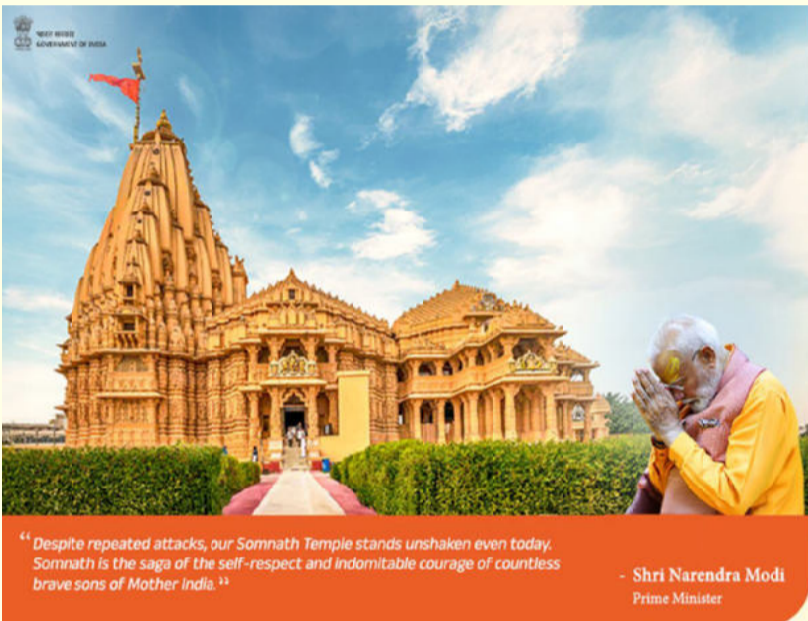
"Despite repeated attacks, our Somnath Temple stands unshaken even today. Somnath is the saga of the self-respect and indomitable courage of countless brave sons of Mother India."

Sri Vijaya Puram, May 8 The Ministry of Culture, Government of India is organizing the Somnath Swabhiman Parv - 1000 Years of Resilience and Unwavering Faith, a year-long national commemoration from January 11, 2026 to January 11, 2027. This historic occasion marks 1000 years since the first attack on Somnath in 1026 AD and 75 years of the temple's reconstruction and inauguration in May 1951.