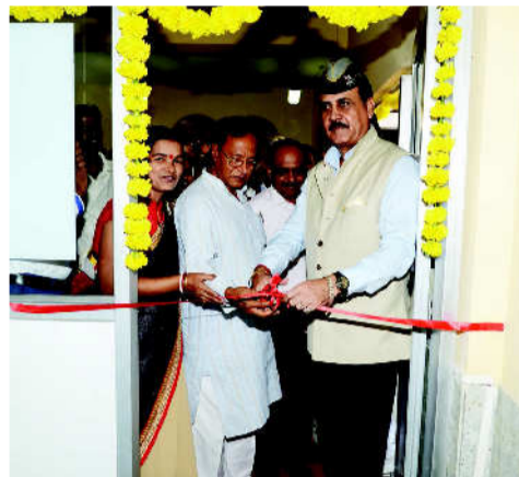
Launching of LED Bulbs Distribution under Hon'ble Prime Minister's National Programme on DELP Scheme by Lt. Gen. A.K. Singh, PVSM, AVSM, SM, VSM (Retd.) Hon'ble Lt. Governor of A&N Islands on Saturday 09th July, 2016 at 1045 hrs. at the premises of Zilla Parishad, South Andaman

"Let's work together and bring a golden period for A&N Islands": LG