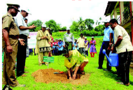
mostly of jackfruit, guava, amaltas, ixora and neem, karanj and a few other flowering species like

Port Blair, July 9 As part of 67th Van Mahotsav, 2016 celebration, the Department of Environment and Forests carried out a mass tree planting at Government Middle School, Sippighat yesterday. All the students, ranging from tiny tots of pre-kindergarten level till standard 8th participated enthusiastically along with their Head Master and teachers in this noble act of planting trees in the school campus.