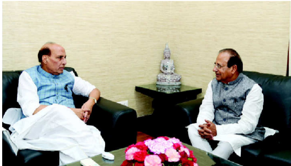
Prof Jagdish Mukhi, Hon'ble Lt Governor of A&N Islands, called on Hon'ble Union Home Minister, Shri Rajnath Singh at New Delhi on 9th October 2016 and discussed various important issues pertaining to the A&N Islands.