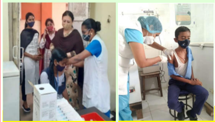
Vaccination of children (15-18 years) at HWC Tugapur