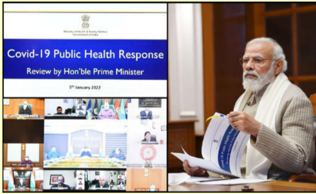
highlighting the surge in cases currently being reported globally was given by Secretary, Health. This was followed by the status of COVID-19 in India

New Delhi, Jan. 9 Prime Minister, Shri Narendra Modi today chaired a high-level meeting to assess the COVID-19 pandemic situation in the country, ongoing preparedness of health infrastructure and logistics, status of the vaccination campaign in the country and the emergence of new COVID-19 variant Omicron and its public health implications for the country. A detailed presentation