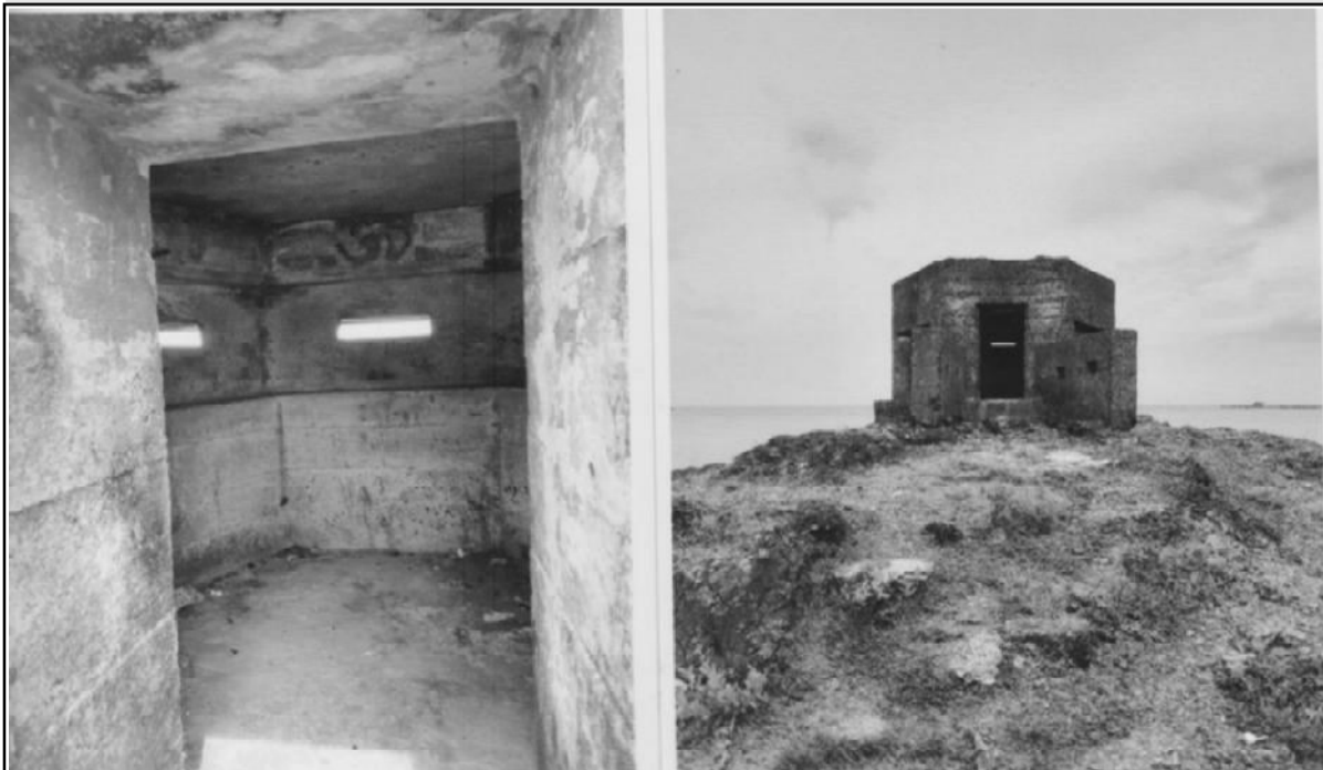
Interior of a hexagonal Japanese pill box with two firing slits at the Corbyn's Cove Beach facing Snake Island

These coastal defences turned the Japanese into a virtually impregnable fortress that could be held by relatively few troops. Japanese were concerned that the open artilleries were too vulnerable for airstrikes. They chose therefore to build bunkers around them with reinforced concrete walls. The Pill boxes were built along the coast as part of the defense of the Islands equipped with machine guns which were positioned at strategic intervals so that their fields of fire would overlap thereby reinforcing each other and covering almost the entire coast. Most of the Pillboxes are rectangular in shape located in the high tide line on the Eastern Coast of South Andaman. Their roof slab is quite thick with two- or three-gun ports on their east-facing wall. Its entrance is on the landward (west) side with air vent come through the western wall.