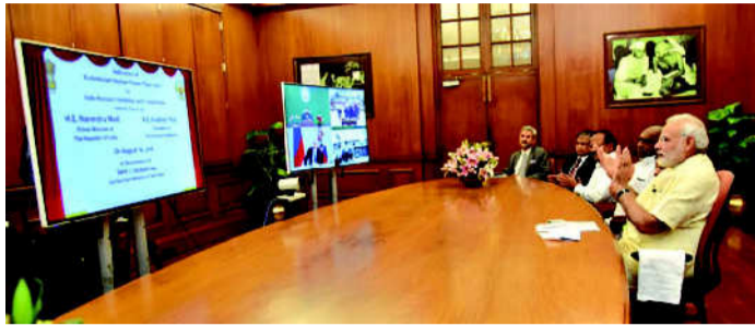
The Prime Minister, Shri Narendra Modi dedicates Kudankulam nuclear power plant unit-1 to the Nation with the President of Russian Federation, Mr. Vladimir Putin and the Chief Minister of Tamil Nadu, Ms. J. Jayalalithaa, through video conferencing, in New Delhi on August 10, 2016.

They were joined by Tamil Nadu Chief Minister Ms J. Jayalalithaa from Chennai. The VVER type light water reactor and its ancillary equipment were supplied by Russian atomic agency Atomstroyexport under an Indo-Russian agreement of