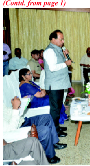
appreciated the Administration for its good work. He also emphasized that a lot more needs to be done for the development of the Islands.