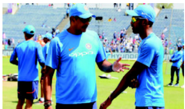
Ajinkya Rahane (vice-captain), Rohit Sharma, Wriddhiman Saha (wicket-keeper), Ravichandran Ashwin, Ravindra Jadeja, Kuldeep Yadav, Mohammed Shami, Umesh Yadav, Bhuvaneshwar Kumar, Ishant Sharma.

New Delhi, Nov 10 Hardik Pandya has been rested for the three-Test series between India and Sri Lanka. The Baroda all-rounder was earlier named in the Indian cricket team squad for the first two Test matches. The Board of Control for Cricket in India said Pandya was rested to manage his workload. The 24-year-old has been playing virtually non-stop cricket, including making his Test debut against Sri Lanka in Galle in July 2017. The national selectors have not named a replacement for Pandya, who seemed to have hurt his left hand during the rain-hit T20 match against New Zealand on Tuesday. Pandya will undergo strength conditioning at the National Cricket Academy in Bangalore. The squad for the first two Test vs Sri Lanka is as follows: Virat Kohli (captain), KL Rahul, Murali Vijay, Shikhar Dhawan, Cheteshwar Pujara,