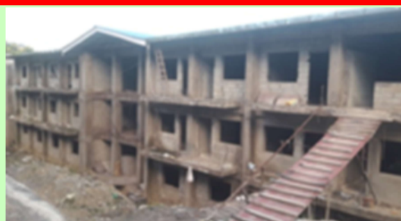
New triple storied building of Girls Hostel at ANCOL under construction the college campus. The 100-bedded capacity hostel building is a model college project funded by Rashtriya Uchchatar Shiksha Abhiyan (RUSA) under the Ministry of Human Resource Development (MHRD). The hostel building will provide accommodation to (Contd. on last page)

With a focus to provide affordable and comfortable accommodation for girl students, a new spacious hostel building for girl students pursuing higher education in A n d a m a n Nicobar College (ANCOL) is being constructed at