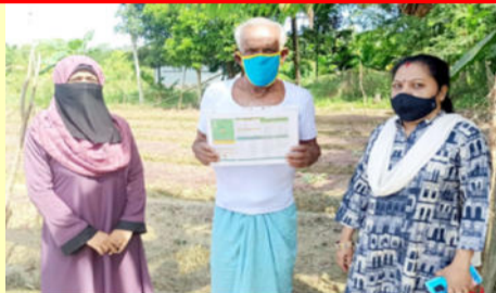
An Isles farmer with Soil Health Card

The main objective of this programme is to issue Soil Health Cards, every 3 years to all farmers, so as to provide a basis to address nutrient deficiencies in fertilizer application practices besides it also aims to ensure quality control requirements of fertilizers, bio-fertilizers and organic fertilizers under the Fertilizer (Control) Order