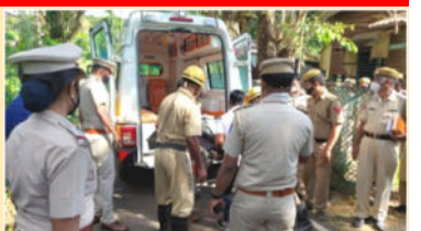
jurisdiction of Police Station (Contd. on last page)

In order to strengthen the preparedness of various units of the Andaman & Nicobar Police Department, a Mock Drill was conducted today. A scenario of 'collapsed structure and people entrapped therein' was simulated during the exercise in Junglighat area under the (Contd. on last page)