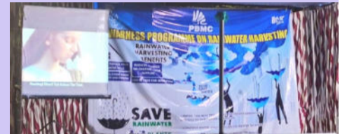
harvesting helps reduce demands during peak (Contd. on last page)

As part of creating awareness on rain water harvesting, the Port Blair Municipal Council (PBMC) conducted an awareness program at Dairy Farm Basti on Jan. 8. People were briefed on importance of water conservation through 'Rain Water Harvesting'. Water is the elixir of life and has to be used judiciously. (Contd. on last page)