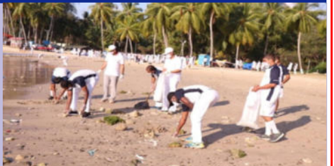
pristine Islands. He emphasized the dedication and commitment of Coast Guard fraternity towards rendering selfless (Contd. on last page)