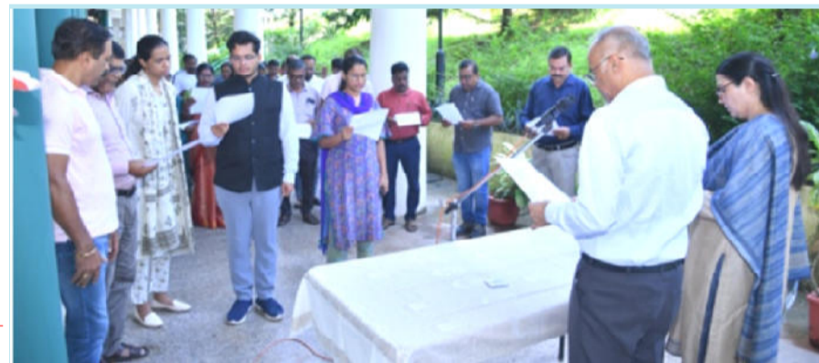
As part of Rashtriya Ekta Diwas observance, pledge was administered to the Officers and Staff of A&N Administration at Secretariat on 31.10.2024.

(Admiral D K Joshi) PVSM, AVSM, YSM, NM, VSM (Retd.) Lieutenant Governor Andaman & Nicobar Islands & Vice Chairman, Islands Development Agency