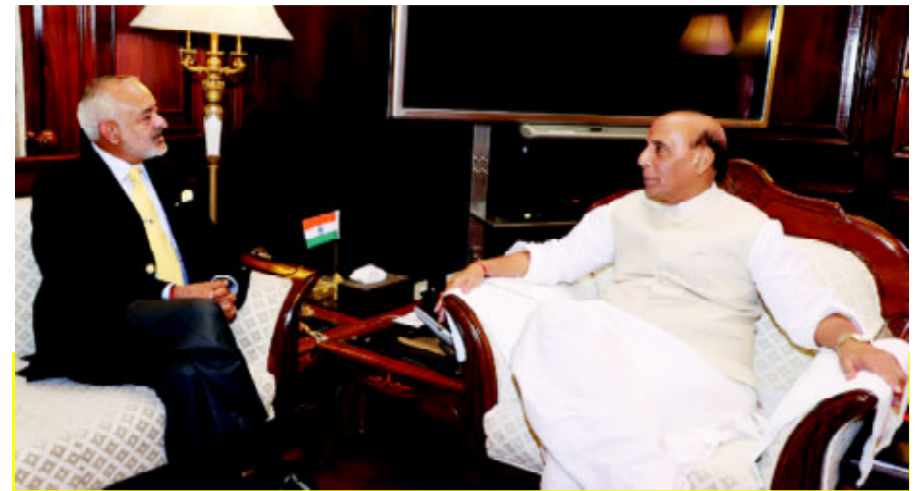
The Lieutenant Governor of Andaman and Nicobar Islands, Admiral (Retd.) D.K. Joshi calling on the Union Home Minister, Shri Rajnath Singh, in New Delhi on October 11, 2017.