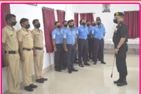
CINCAN visits Naval Transmission Station, Teylarabad