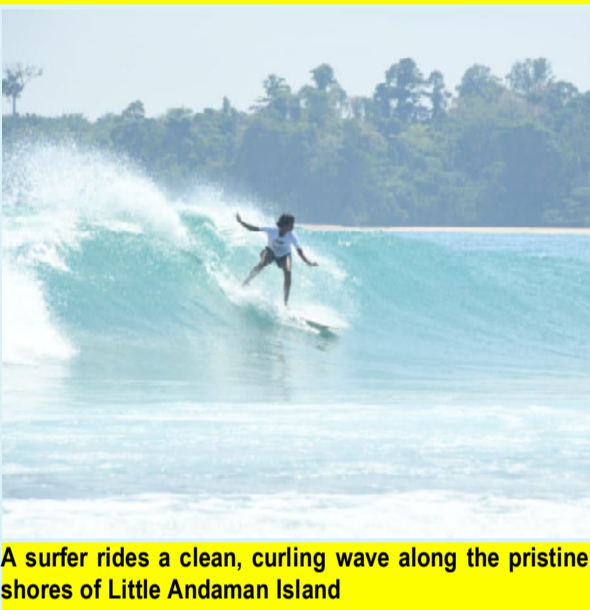
A surfer rides a clean, curling wave along the pristine shores of Little Andaman Island

Little Andaman, Apr. 12 The grand finale of the Little Andaman Pro 2026 hosted by the Andaman & Nicobar Tourism in association with the Surfing Federation of India delivered a spectacular close to three days of high-intensity competition, with India's top surfers and stand-up paddle boarders showcasing exceptional skill and determination against the stunning backdrop of the Andaman & Nicobar Islands.