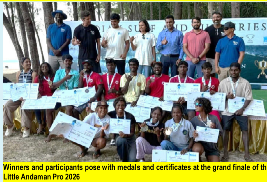
Winners and participants pose with medals and certificates at the grand finale of the Little Andaman Pro 2026