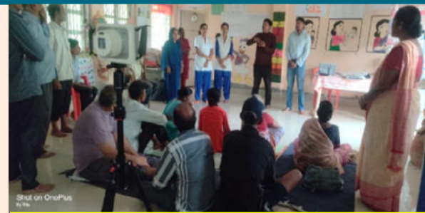
Ayushman Arogya Shivir conducted at AWC Baludera and AAM Kaushalya Nagar

Sri Vijaya Puram, June 12 The Andaman & Nicobar Administration has been actively implementing the TB Mukht Bharat Abhiyaan - 100 Days Intensified Campaign since its launch on 24 th March, 2026, in alignment with national guidelines. The campaign focuses on a comprehensive and targeted approach to eliminate Tuberculosis (TB), with key objectives including: >Early identification of all missing TB cases through proactive