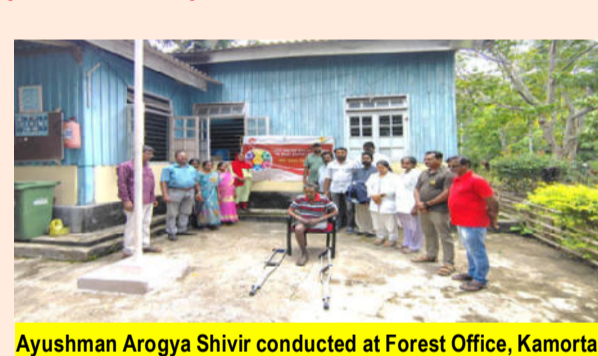
Ayushman Arogya Shivir conducted at Forest Office, Kamorta

(Contd. from page 1) household contacts and People Living with HIV (PLHIV). > Promotion of Janbhagidari through a 'Whole-of-Society' and 'Whole-of-Government' approach to raise awareness, reduce stigma, and encourage timely health-seeking behaviour.