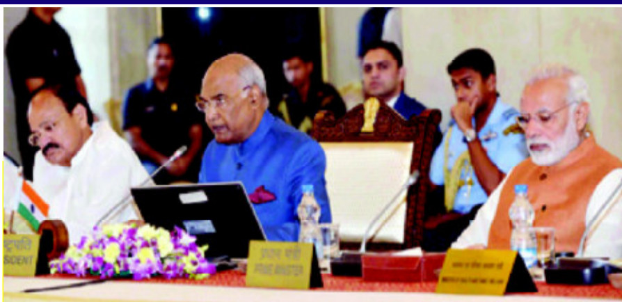
The President, Shri Ram Nath Kovind addressing the opening session of the 48th Conference of Governors, at Rashtrapati Bhavan, in New Delhi on October 12, 2017. The Vice President, Shri M. Venkaiah Naidu and the Prime Minister, Shri Narendra Modi are also seen.

Vice President Shri M Venkaiah Naidu, Prime Minister Shri Narendra Modi and Home Minister Shri Rajnath Singh were also present on the occasion.