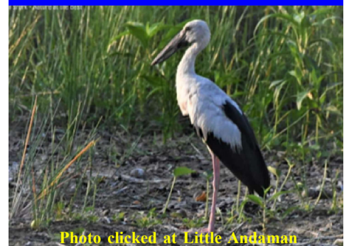
Photo clicked at Little Andaman

Port Blair, Jan. 12 Indian subcontinent and Southeast Asia. The Asian Openbill Stork migrated to Little Andaman recently. It is a large wading bird. This is found mainly in the