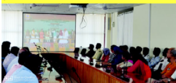
Launching ceremony of PM- KISAN Scheme at N&M Andaman

small and marginal farmer families with a total cultivable land holding upto 2 hectares, wherein a