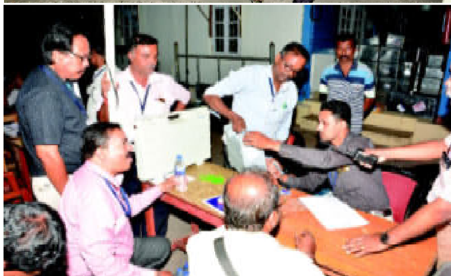
Polled EVMs being collected at the Collection Centre at JNRM Strong Room