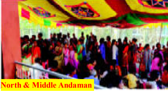
North & Middle Andaman