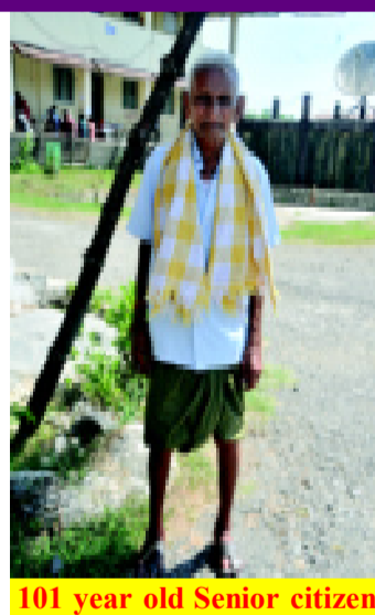
101 year old Senior citizen