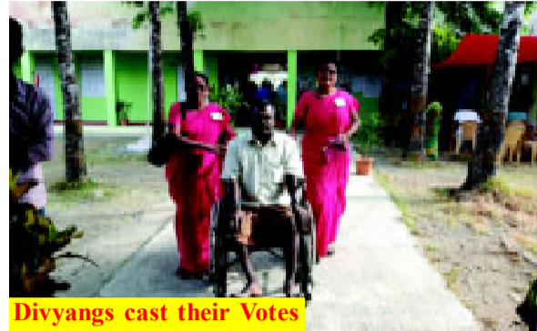
Divyangs cast their Votes