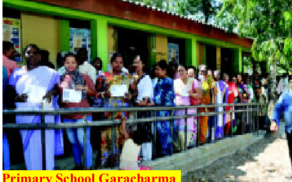
Primary School Garacharma