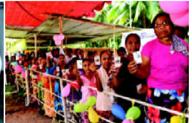
Voters at Perka Village, Car Nicobar