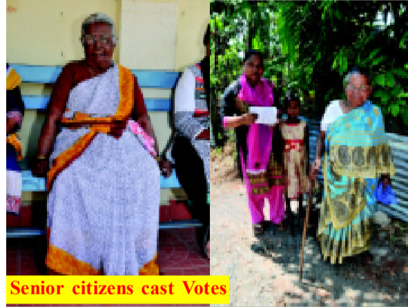
Senior citizens cast Votes