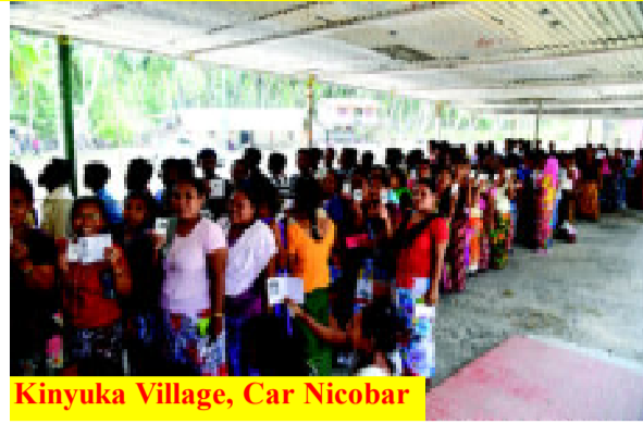
Kinyuka Village, Car Nicobar