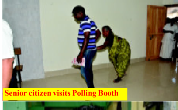
Senior citizen visits Polling Booth