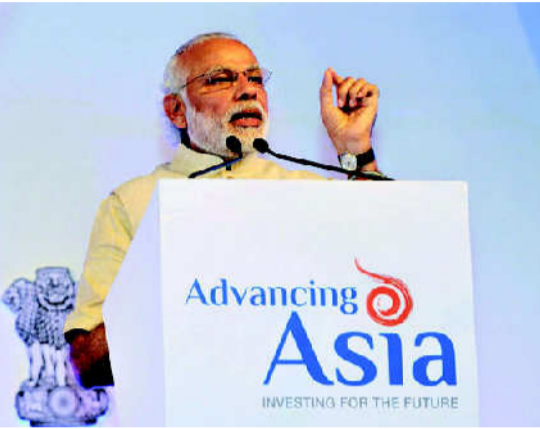
investment in the rural and agriculture sector and aims to double farmer incomes. Shri Modi said India has never undervalued its exchange rate to boost trade and signaled that the country would

Shri Modi said India has a special place in Asia and it has historically contributed to Asia in several ways. India has also shown that a large, diverse country can be managed in a way that can promote economic growth and maintain social stability. Prime Minister said corruption and interference in the decisions of banks and regulators are now things of the past. He said government has increased