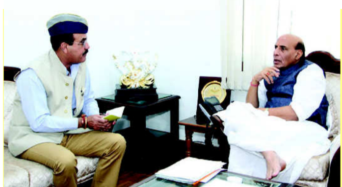
The Lt. Governor of Andaman & Nicobar Islands, Lt. General (Retd.) A.K. Singh calling on the Union Home Minister, Shri Rajnath Singh, in New Delhi on March 13, 2016.

country has recommended for setting up an Indian Cyber Crime Coordination Centre. He said, with the increasing inter-connectivity in the world, the challenges will come and India must find ways to tackle these challenges and address the security loopholes in the networks.